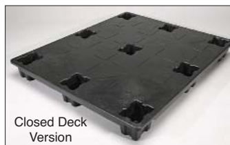
Closed Deck Version