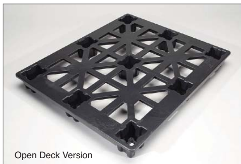
Open Deck Version

• The most cost-effective export pallet that meets all international shipping standards!