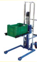
Adjustable Box Stacker MODEL VE-ABS-130 $536.32