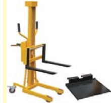
Portable Hand Winch Lifter MODEL VE-HWL-330 $463.46