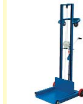
Low Profile Lite Load Lifts MODEL VE-LLPW-500-FW $617.62