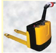
Fully Powered Electric Pallet Trucks Search: VE-EPT Starting at: $2,785.78