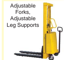
Stacker w/Powered Lift MODEL VE-SL-118-AA $2,785.78