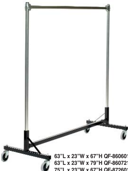
63" L x 23" W x 67" H QF-860601 .....$88.62 63" L x 23" W x 79" H QF-860721 .....$93.63 75" L x 23" W x 67" H QF-872601 .....$98.63 75" L x 23" W x 79" H QF-872721 .....$103.64