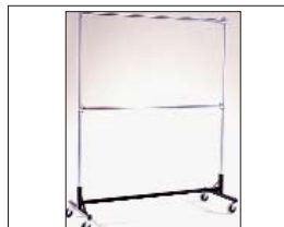
63" L x 23" W x 67" H QF-860602 PRICE: $101.49 63" L x 23" W x 79" H QF-860722 PRICE: $106.50