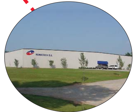
Numatech Southeast Manufacturing Taylors, SC