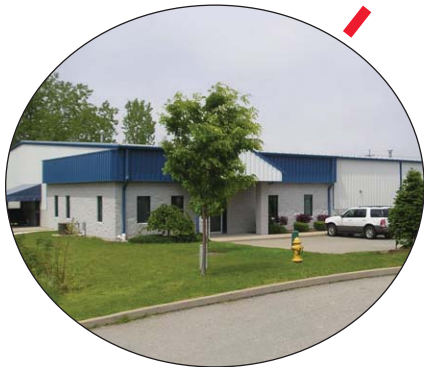
Amatech Manufacturing Erie, PA

BETTER MATERIAL HANDLING PRODUCTS Sales / Customer Service Wilkes-Barre, PA • USA