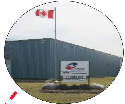
Numatech Canada Manufacturing Cambridge, ON Canada