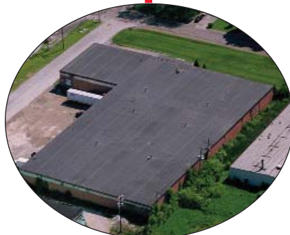
Polycel Manufacturing Columbus, OH