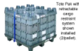
Tote Pak with retractable cargo restraint system shown installed (2/pallet).