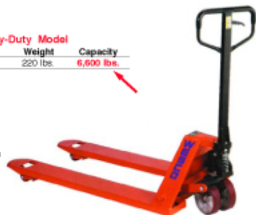
7" Wide Forks