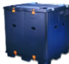
Twin-Sheet Thermoformed BIG PAK 45" x 45" x 42" H. (min. qty. required)