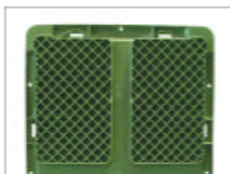
Reinforced Bottom (R)