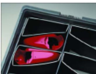
Call for custom dunnage options.

Call for options such as dunnage, cardholders, label placards, hot stamped logo identification, and pallets and top caps to match your NSO or SO Systems.