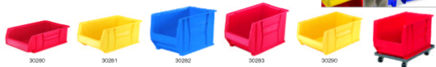
AkroBin Solid Steel Dollies (Model No. AK-RU842HR2018 & AK-RU842HR2918) are available for efficient parts transport.