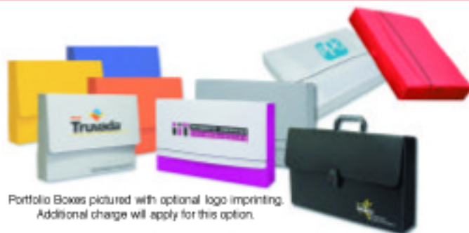
Portfolio Boxes pictured with optional logo imprinting. Additional charge will apply for this option.

Ideal for literature packets or advertising materials. An attractive promotional or sales presentation product. Can be customized with your logo or graphics. Call for logo imprinting options (extra charge will apply). Two Sizes Available: Letter or Legal Size. Minimum quantity 100.