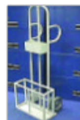
Modified Hand Truck for Tubes