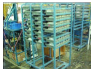
Tray racks can be customized to fit any size or quantity of shallow totes or trays