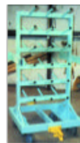
Pin truck for piece goods storage