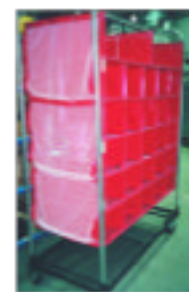
Garment Rack & collapsible vinyl compartments