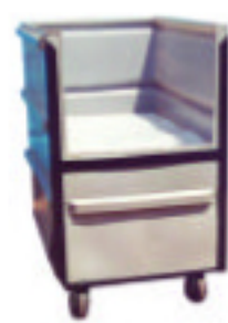
Poly Truck with out-out side