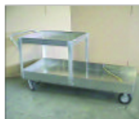
Two Level Picking Cart with bulk box area below