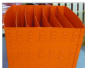
Dividers & Compartments such as this sturdy tall unit can be designed to fit any container.