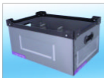
Heavy Duty stackable secure containers can be fabricated from heavier gauge corrugated plastic.

Ted Thorsen boast 5 manufacturing locations to better serve your corrugated plastic requirements. Contact Ted Thorsen with your tote and reusable container projects. We will gladly provide a prompt quote. Corrugated plastic can be fabricated into: dunnage and dividers, custom size tote boxes and distribution containers, special shape and size containers, pallets, and signage. Corrugated Plastic is a very cost effective choice. has in-house die-cutting capabilities as well as in-house screen printing facilities. Customize your corrugated plastic products further with logo or graphics imprinting.