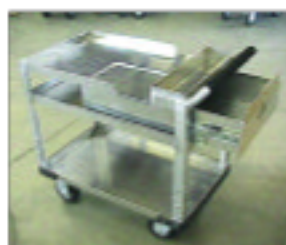
Modified Aluminum Shelf Truck with locking drawer and compartments