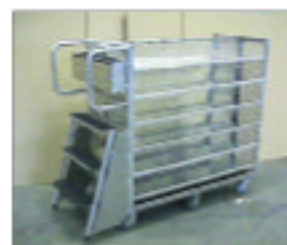
Two-sided six level slanted shelf order pick ladder truck with supplies bin