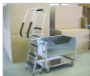
Ladder Truck with bulk picking bin.