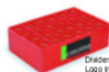
Divider Box With Logo Imprinting