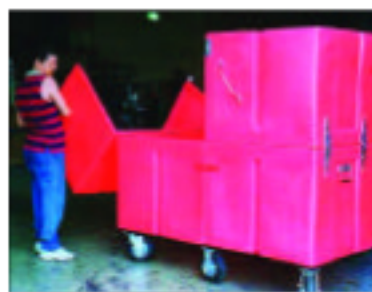
Poly Bulk Truck with hinged, fold-down top sections